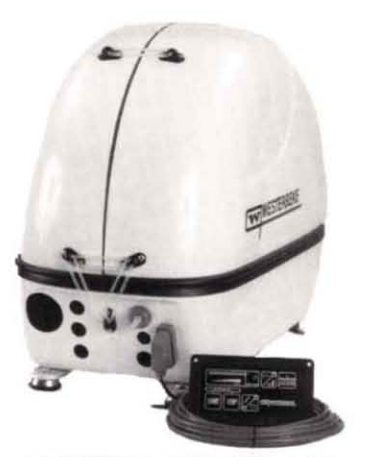
4.2 BCDT Marine Diesel Generator

The AC generator is enclosed in a watercooled stainless steel jacket. This allows the 4.2 BCDT greater sound deadening since larger openings in the sound shield are no longer required for air-cooling. The water-cooled jacket is oversized which eliminates blockages and provides a maximum flow of cooling water around the generator. The water jacket also cools the air going through the rotor of the generator, the engine combustion air and the unit mounted controls for the engine and regulation of the AC generator voltage. The diesel engine is also equipped with an oil cooler that insures proper engine lubrication and cooling in installations with high ambient air and cooling water temperatures.