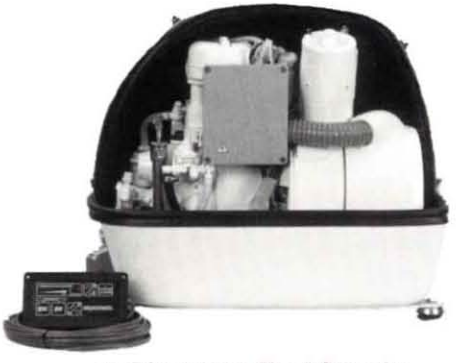
4.2 BCDT Marine Diesel Generator

The standard plug-in remote control panel is designed to be user friendly and provides the operator with all the necessary information and controls to use the generator. The panel includes one-touch start/stop controls, automatic shutoffs with indicating lights for low oil pressure and high engine temperature, a battery charge indicator light and an AC load indicator.